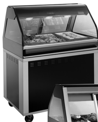
EU2SYS-48 FRONT VIEW SHOWN WITH OPTIONAL CASTERS