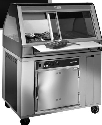
EU2SYS-48 BACK VIEW SHOWN WITH 750-TH-II COOK & HOLD OVEN AND OPTIONAL CASTERS